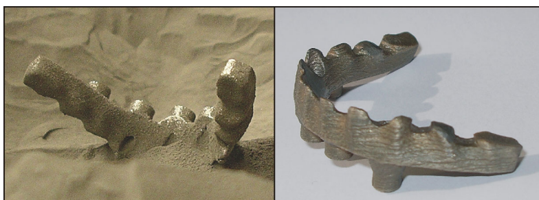
Dental framework manufactured by SLM of Ti6Al4V.

This research tries on the one hand to optimize the processing of biocompatible materials by SLS/SLM and on the other hand to apply this knowledge for some realistic case-studies. A digital procedure is developed for the production of implant-supported frameworks for complex dental prostheses by means of SLM of a titanium-alloy (Ti6Al4V) or a dental cobalt-chromium-alloy. Offering a digital solution to the dental profession implies a real challenge because patient and dentist set high requirements on quality, material and precision. Personalized frameworks are manufactured with good mechanical properties and with a medically acceptable accuracy. Next to this dental application, the production of scaffolds by means of SLS of a polymer is studied. Scaffolds are porous structures for large bone defects which allow injected bone cells to develop into new bone material. The complex internal structure of the scaffold can be produced in a fully controlled way by SLS, so that optimal pore dimensions can be obtained.